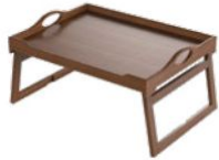
Classic Breakfast Tray with legs

Dim 655 x 400 x 285 mm 25.8 x 15.7 x 11.2"