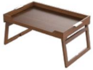
Modern Breakfast Tray with Legs