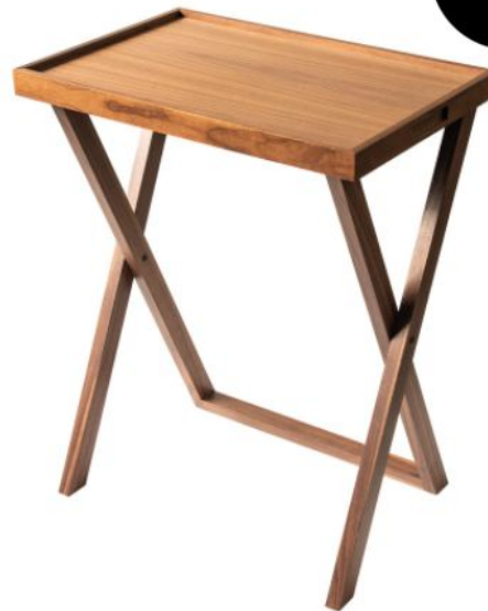
Folding Tray Table