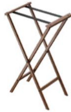
Butler Tray Stand

Dim 656 x 450 x 311 mm 23.6 x 17.7 x 12.2"