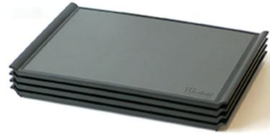
Black Wave Tray

Note Fits: All trays except for Classic Butler Tray Medium and Modern Drinks Tray