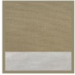
RAW-TAUPE 10566 WHITE