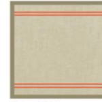
RAW-GREY 05066 RED

80% COTTON - 20% LINEN NAPKIN 20"x20" - 22"x22" 2 plain hems & 2 Selvages