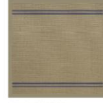
RAW-TAUPE 05074 BLUE