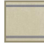
RAW-GREY 05068 BLUE