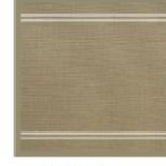
RAW-TAUPE 05070 WHITE