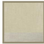
RAW-GREY 10565 RAW-TAUPE