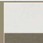
NATURAL 10038 CHOCOLATE