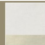
NATURAL 10039 TOBACCO