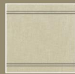
RAW-GREY 05065 WARMGREY