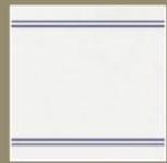
NATURAL 04136 BLUE