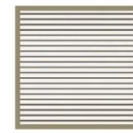
NATURAL 04130 CHOCOLATE