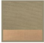
RAW-TAUPE 10567 ORANGE