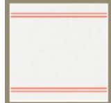
NATURAL 04134 RED