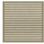
RAW-GREY 05064 CHOCOLATE