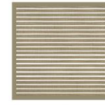
RAW-TAUPE 05070 WHITE