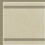
RAW-GREY 05064 CHOCOLATE