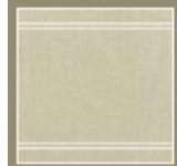
RAW-GREY 05063 WHITE