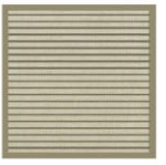
RAW-GREY 05065 WARMGREY