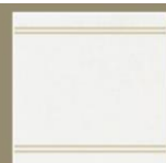
NATURAL 04132 RAW-TAUPE