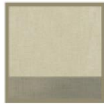
RAW-GREY 10564 WARMGREY