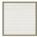
NATURAL 04131 RAW-GREY