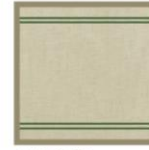
RAW-GREY 05067 GREEN