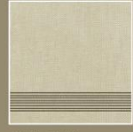
RAW-GREY 05064 CHOCOLATE