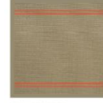
RAW-TAUPE 05072 RED