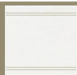
NATURAL 04131 RAW-GREY