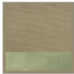
RAW-TAUPE 10570 LIME