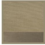
RAW-TAUPE 10568 CHOCOLATE