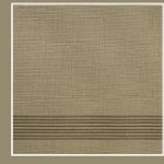
RAW-TAUPE 05071 CHOCOLATE