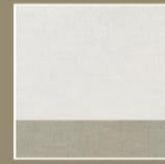
NATURAL 10041 WARMGREY