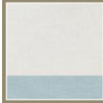
NATURAL 10040 LIGHT BLUE