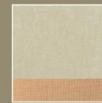
RAW-GREY 10562 ORANGE