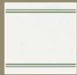
NATURAL 04135 GREEN