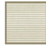
RAW-GREY 05063 WHITE