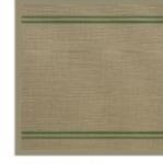
RAW-TAUPE 05073 GREEN