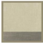
RAW-GREY 10563 CHOCOLATE