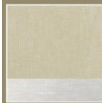
RAW-GREY 10560 WHITE