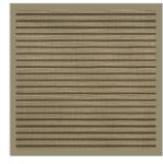
RAW-TAUPE 05071 CHOCOLATE