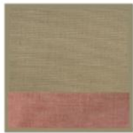
RAW-TAUPE 10569 RED