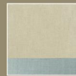
RAW-GREY 10561 LIGHT BLUE