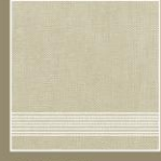
RAW-GREY 05063 WHITE