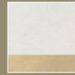
NATURAL 10042 HONEY