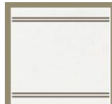
NATURAL 04130 CHOCOLATE