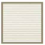
NATURAL 04132 RAW-TAUPE