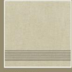
RAW-GREY 05065 WARMGREY