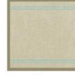
RAW-GREY 05069 LIGHT BLUE