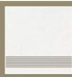
NATURAL 04130 CHOCOLATE

80% COTTON - 20% LINEN NAPKIN 20"x20" - 22"x22" 2 plain hems & 2 selvages