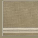
RAW-TAUPE 05070 WHITE