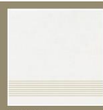
NATURAL 04132 RAW-TAUPE