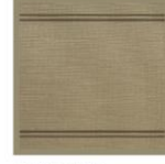
RAW-TAUPE 05071 CHOCOLATE