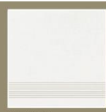
NATURAL 04131 RAW-GREY