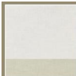
NATURAL 10037 GREY